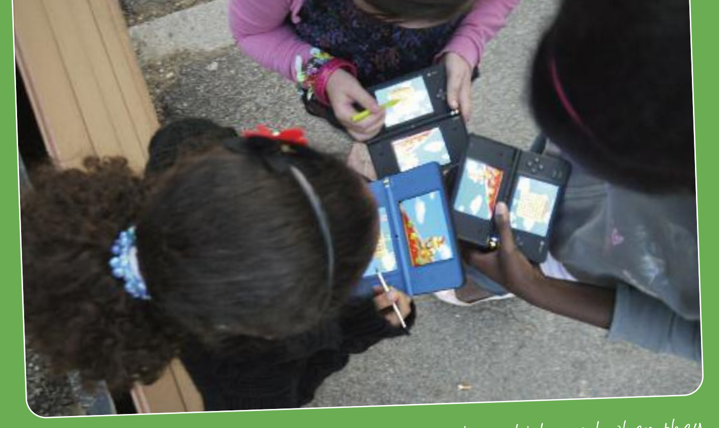
"It always amazes me to see how much my kids read when they are online or playing games. They're really motivated to learn!" Chorlotte - mum of 3 girls.