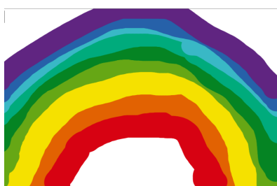
Ewan PC—Year 6