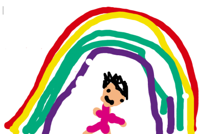
Amber S —Reception