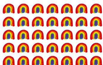
Isaac M - Year 4