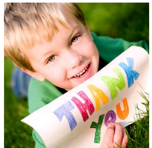
Say thank you whenever someone does something for you.