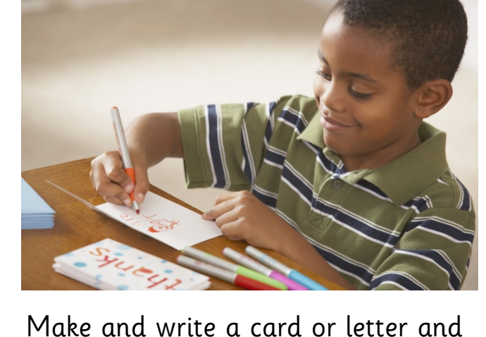
Make and write a card or letter and send it to someone.