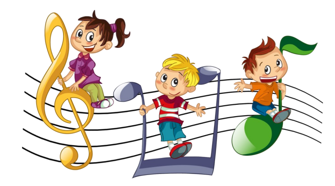
Record a song and send it to a person you love and appreciate, or phone them and sing it to them over the phone.

Be a housework detective and find something you can tidy up or offer to help your grown ups with.