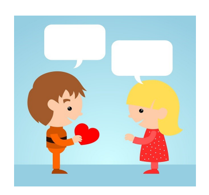
Decide to give away kind words and compliments. Saying things like, "I like your jumper," or, "This dinner is delicious, thank you," can make people feel happy, loved and appreciated.