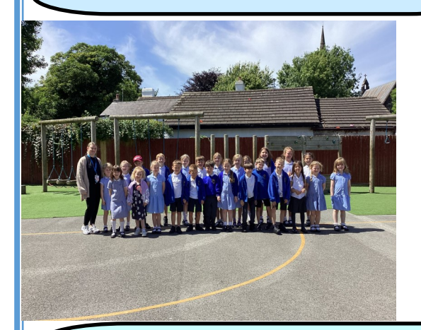
YEAR 4 - "I liked meeting Mr Cummings and doing a raffle."