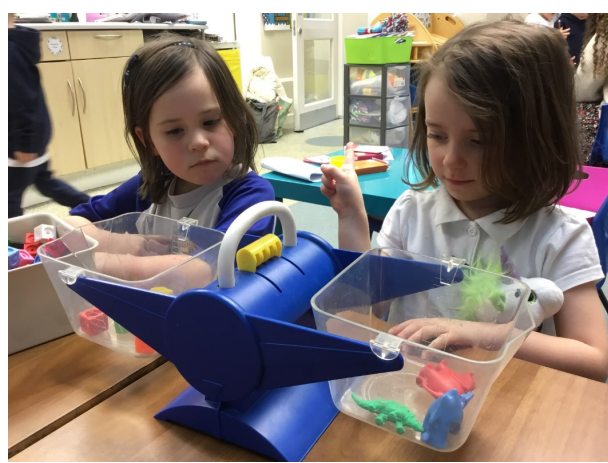
Our Learning This Week...